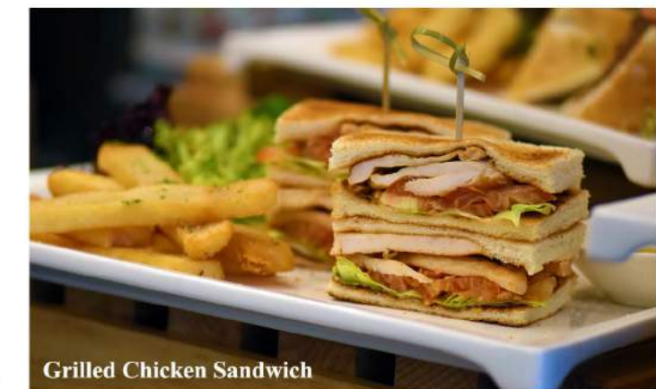
Grilled Chicken Sandwich

Prata Wraps $ 19.90 Choice of: Grilled Chicken Grilled Vegetables ✓